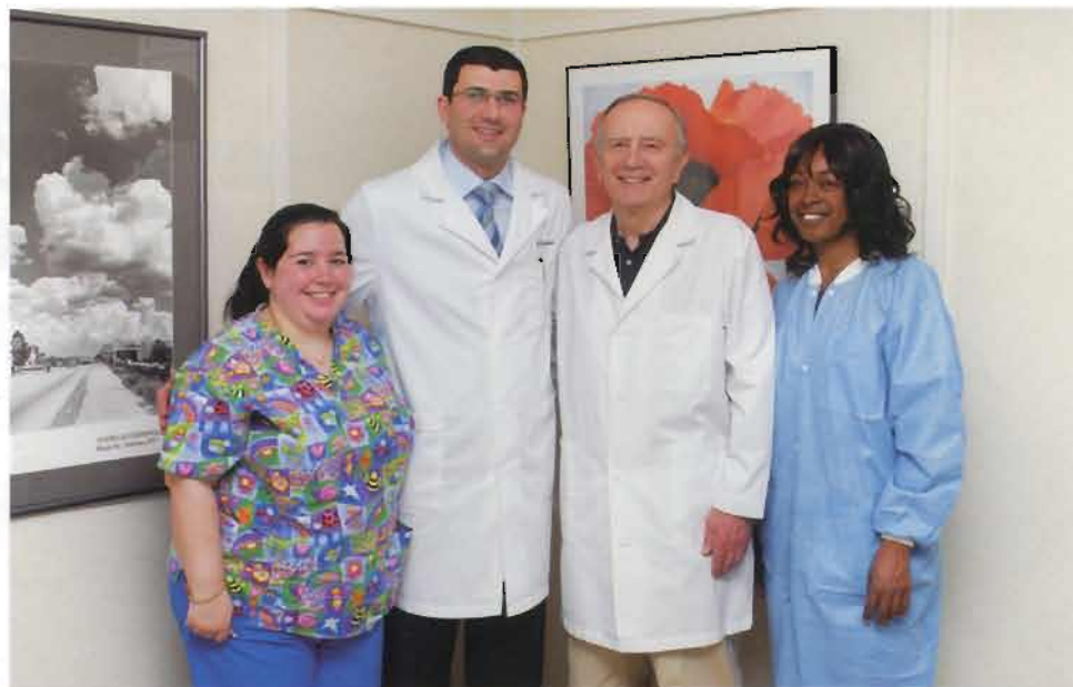
Apex Endodontics now has five full-time staff, including dental assistants and office personnel.

ing in the field of implantology, and he predicts that eventually it will become a part of the daily routine and procedures at Apex Endodontics — much to the benefit of his patients.